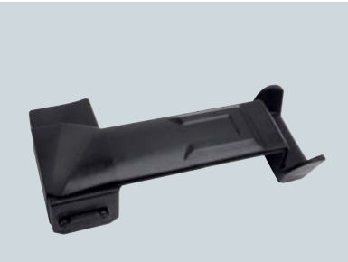
Container Security Device (CSD)