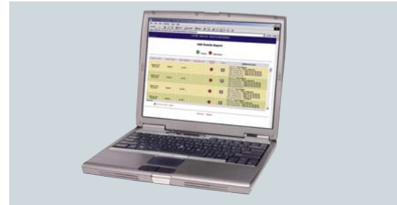
Global access to secure Data Center