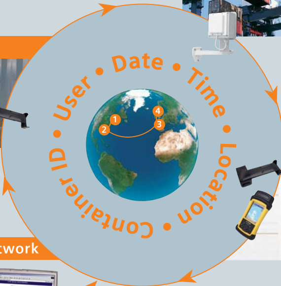
Global container security and visibility with CommerceGuard™.